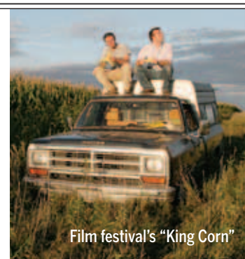
Film festival's "King Corn"